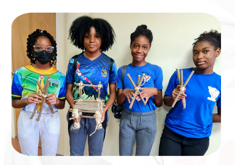
Camp furniture made using lashings.