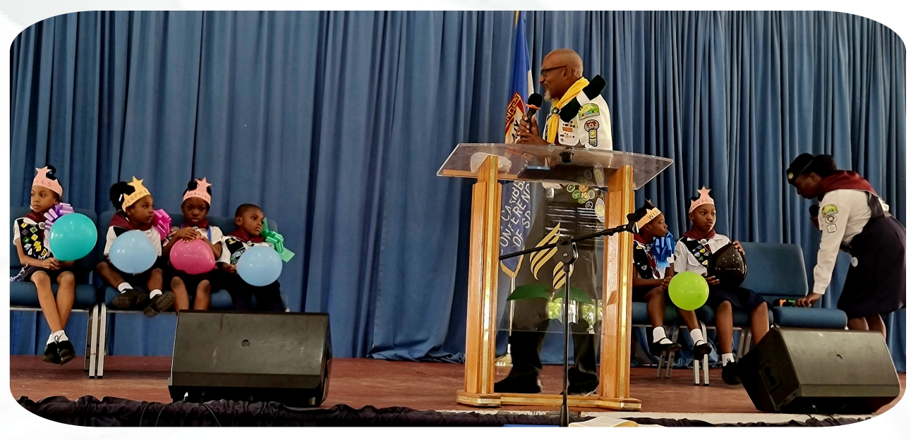
Our Adventurer Club presenting the Primary lesson study at Congressory 2023