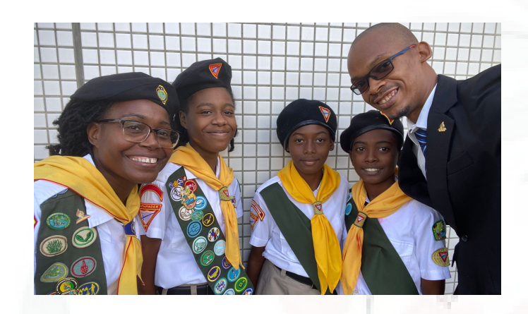
Taken after the National Independence Service at the Gymnasium