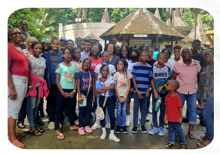
Harrison's cave crew

A trip was organized to visit Harrison's Cave on August 30th, and the event was well attended.