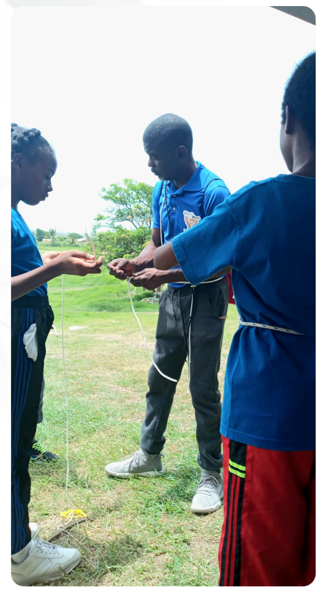
Instructions on knot tying