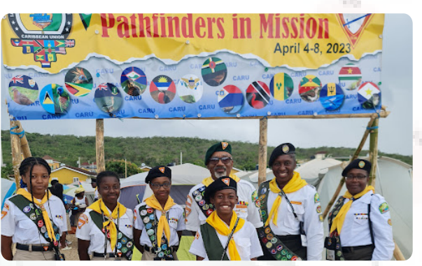
Pathfinders in Mission