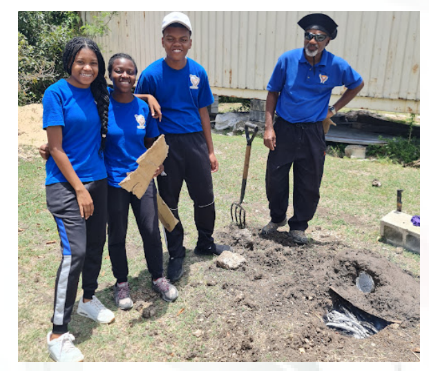
Bite sized bread was baked in this mud oven