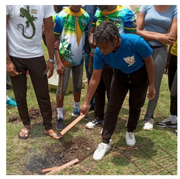
Fire building lesson